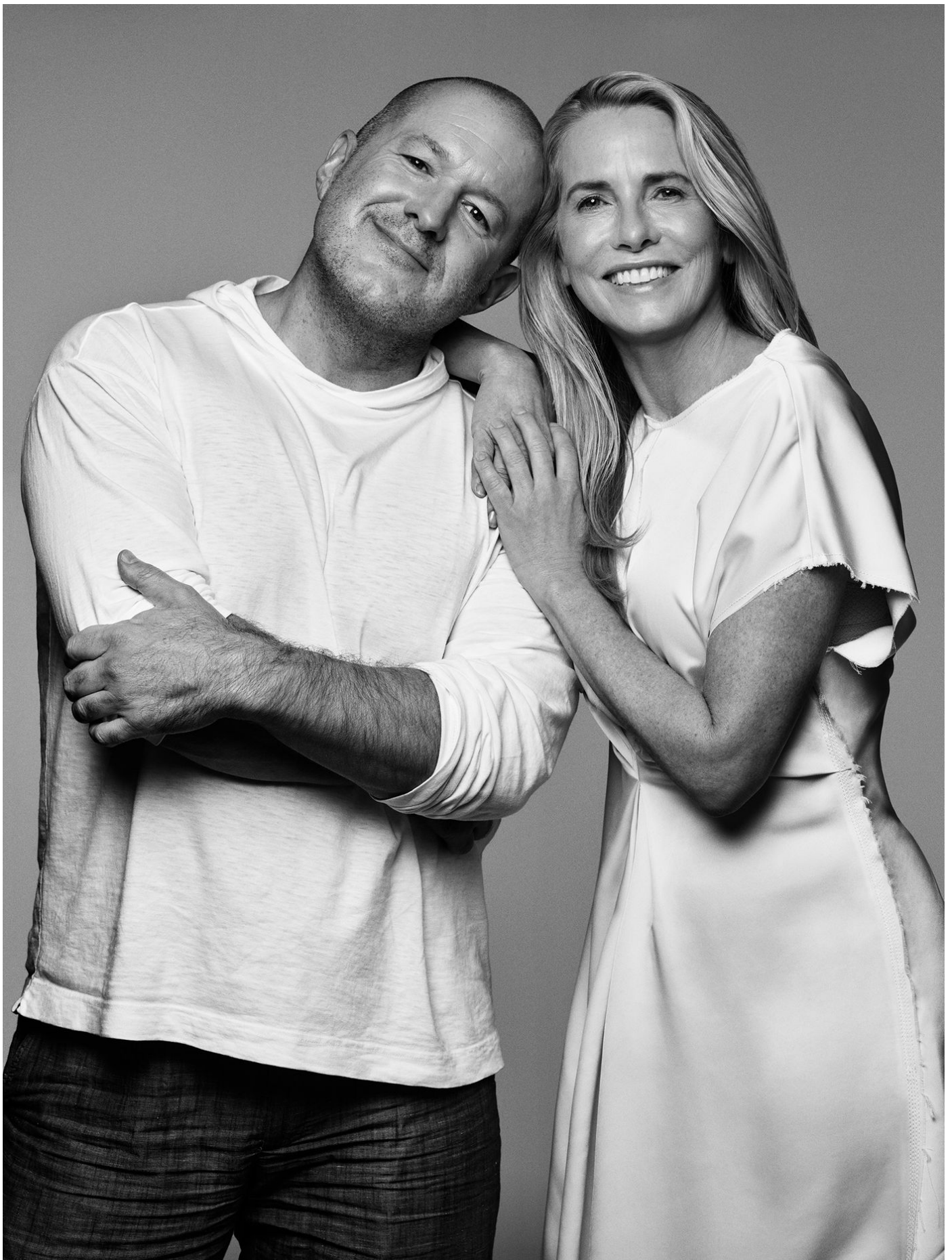
Jony Ive and Laurene Powell Jobs, photographed on September 25, 2021. "Laurene and I at last are working